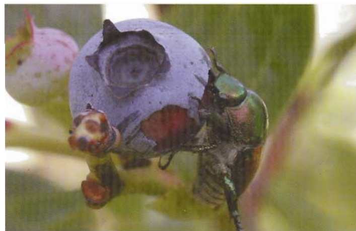
Figure 1. Adult Japanese beetle feeding on ripe blueberry.

Adults are about 13 mm long (Figure 1). The head and thorax are metallic green, and the rest of the upper surface is copper-colored. Five tufts of white hairs on both sides of the lower surface and a sixth pair on the tip of the abdomen are distinguishing