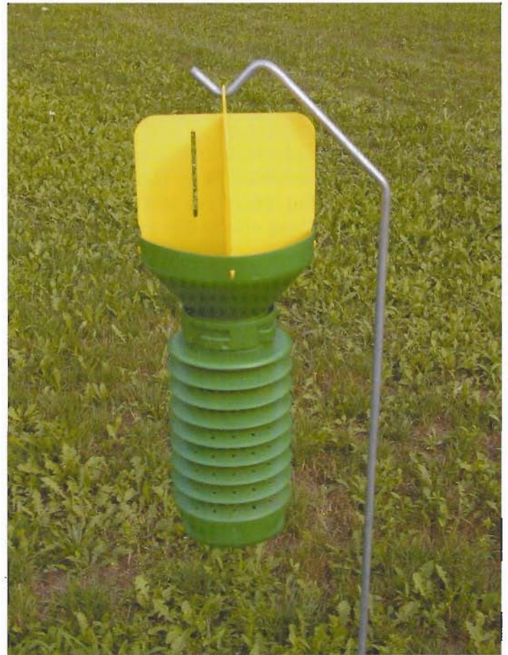
Figure 6. Monitoring trap for Japanese beetle.

Cultural control. One of the most effective control tactics is to make crop fields and nearby areas less suitable for Japanese beetle by integrating many cultural approaches into regular horticultural prac-