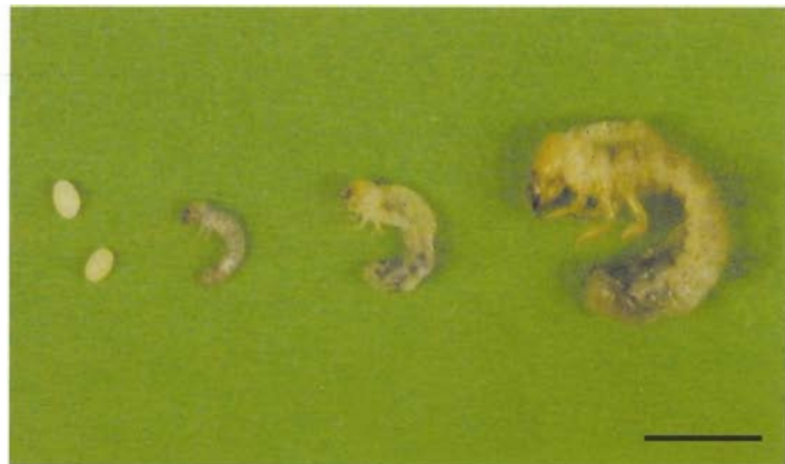
Figure 2. Relative sizes of eggs and first, second and third instar Japanese beetle grubs. Bar = 5mm.

Eggs are 1 to 2 mm in diameter, spherical and white (Figure 2). Females lay batches of eggs 5 to 10 cm below the soil surface, generally in areas with grass and moist soil.