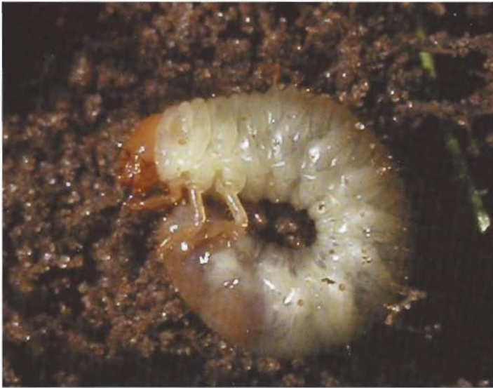
Figure 3. Fully grown third instar grub of Japanese beetle.

Larvae (also known as grubs) are 2 to 3 mm long when newly hatched; fully grown larvae are about 30 mm long (Figure 2). Larvae are C-shaped and white with a brown head capsule and three pairs of legs (Figure 3).